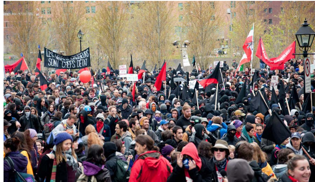
A portion of the crowd assembled for May Day in Montréal.

On May Day 2018, drawing on momentum from the movement against the Loi Travail and the defense of la ZAD at Notre-Dame-des-Landes, tens of thousands of demonstrators gathered in Paris for what proved to be a day of incendiary conflict with the authorities.